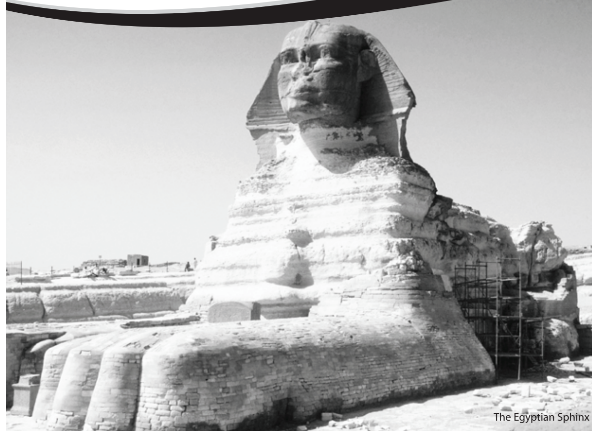
The Egyptian Sphinx