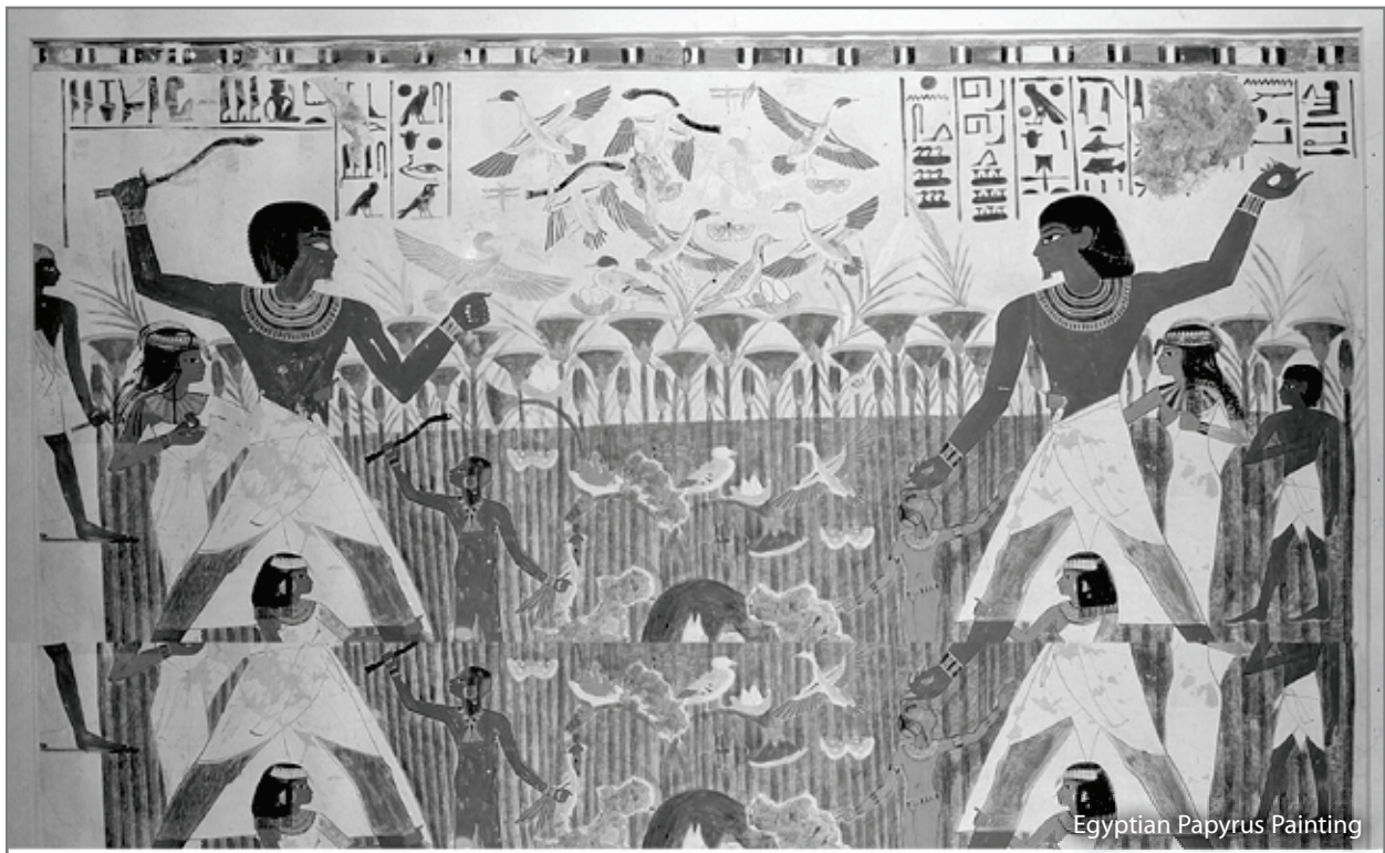
Egyptian Papyrus Painting

Decisions have been made in the last sixty years . . . to throw out the veracity and historicity of Scripture.