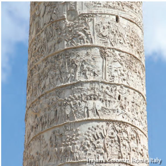
Trajan's Column, Rome, Italy

The fall of Rome was not the fall of the Church, however. Christianity, which had survived persecutions, martyrdoms, heresies, and divisions under the Roman Empire, would continue to grow and thrive despite this unsettled political climate. Jesus had said, "On this rock I will build My church, and the gates of Hades shall not prevail against it" (Matthew 16:18). And His Word continues. ◀