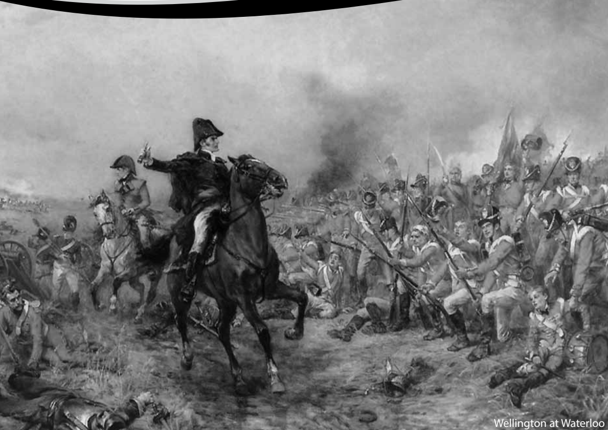
Wellington at Waterloo

As the eighteenth century was coming to its tumultuous end, the untamed furor unleashed during the French Revolution—and the attempt to export this potent brew throughout Europe—set the governments throughout Europe fiercely against France. Across the Atlantic, in the newly birthed United States of America, attitudes ranged from rejoicing to revulsion at the spectacle of French “liberty, equality, fraternity.”